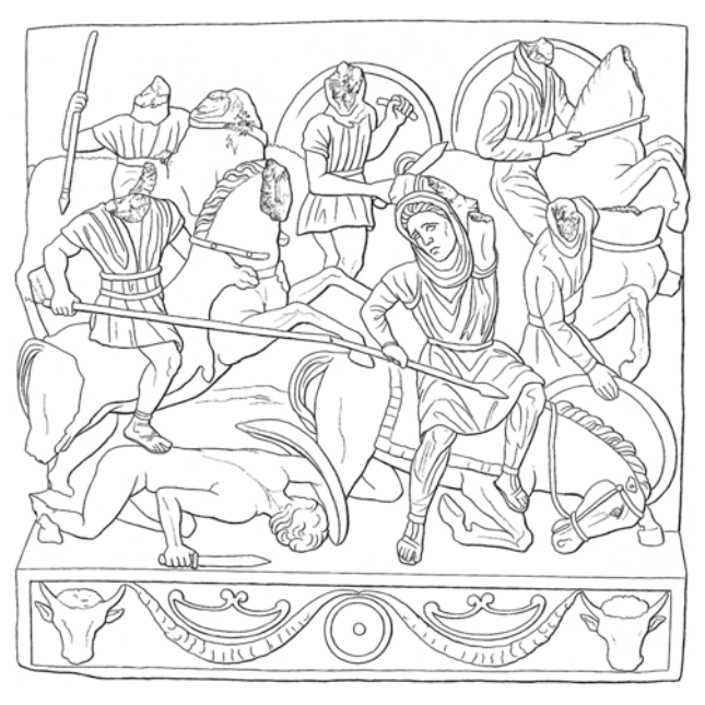
Fig. 11 - Perugia. Drawing of an Etruscan urn from the necropoli del Palazzone (after Körte 1916, pl. CXII, no. 4).

Taxila is revealed by some local coins dated to the end of the 3<sup>rd</sup> century BC, which still show on the reverse the image of a personage in the guise of an Achaemenid satrap.<sup>42</sup>