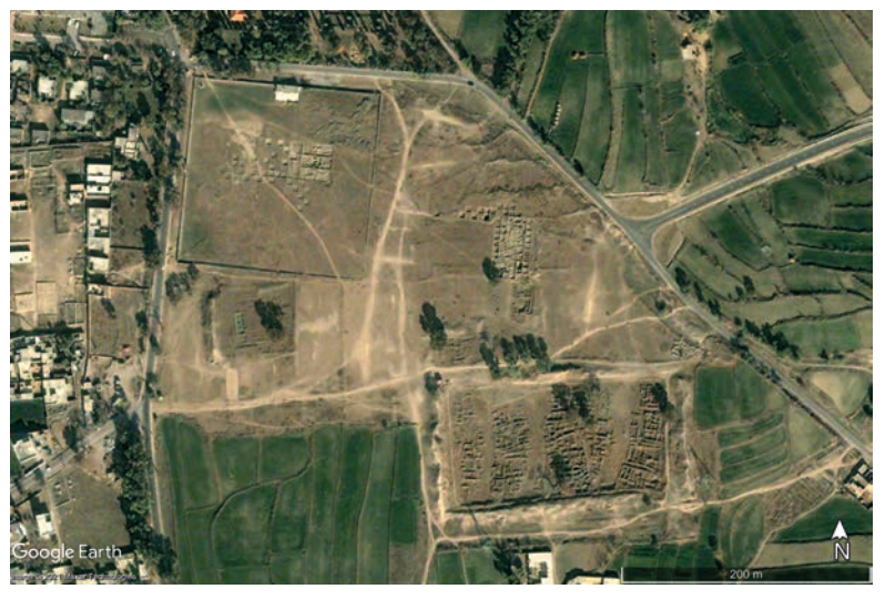
Fig. 3 - The Bhir Mound, Taxila. Satellite image of the site. The "Stadium Area" is the square one on the northwest encircled by a fence.