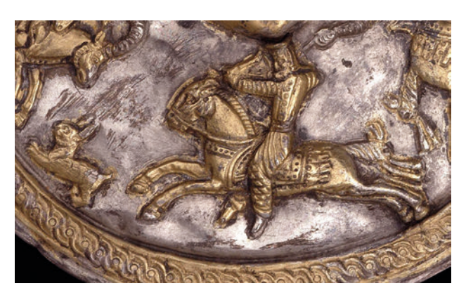
Fig. 4 - "Oxus Treasure". Detail of an embossed silver disk with hunting Persian riders.