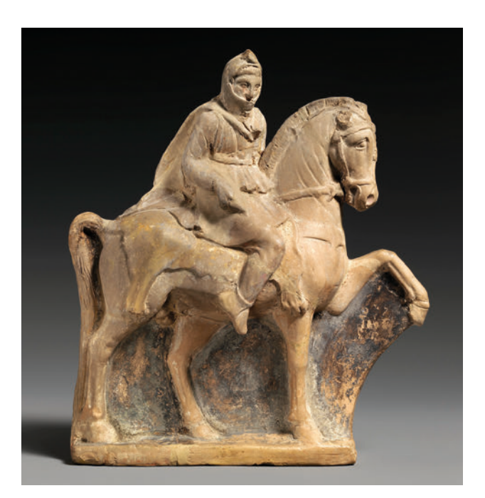
Fig. 10 - Cyprus. Statuette of a Persian rider said to be from the Temple of Apollo Hylates at Kourion (©MET).