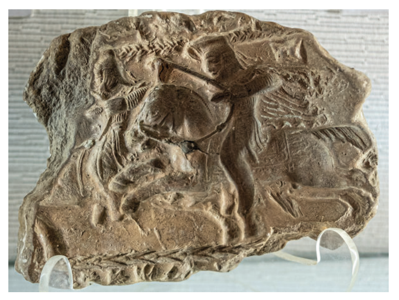
Fig. 1 - The Bhir Mound, Taxila. Fragment of terracotta mould with Persian riders.