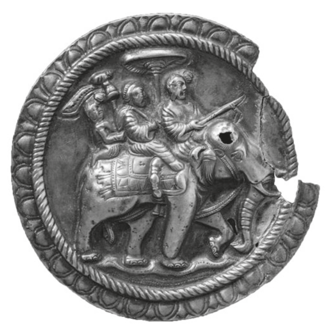
Fig. 8 - Mohallah Mohra Shah Wai Shah, Taxila. Embossed silver disk depicting an elephant with riders (after Gha-FOOR LONE, ULLAH KHAN 2018, fig. 7; present location unknown).