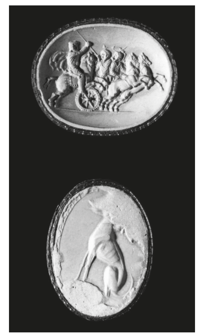
Fig. 6 - Scaraboid seals, said to be from Mesopotamia.