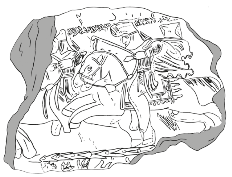
Fig. 2 - Outline of the fragmentary mould from the Bhir Mound, Taxila (author's drawing).