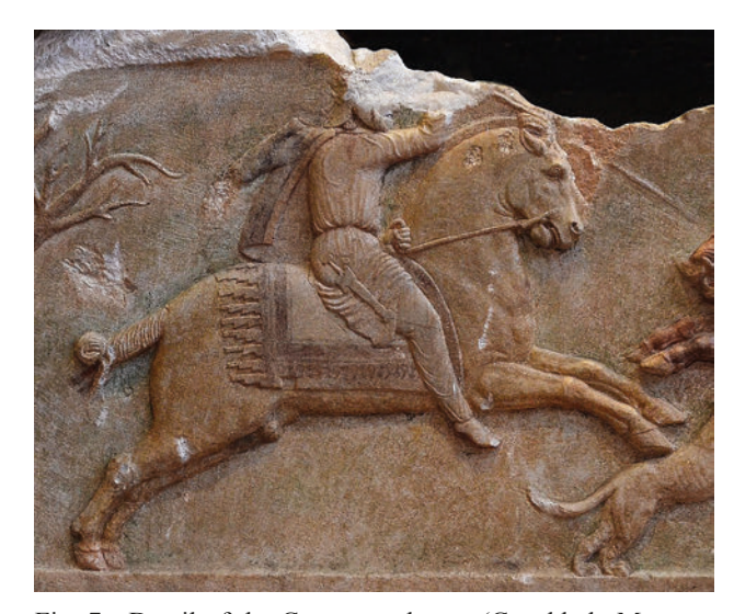
Fig. 7 - Detail of the Çan sarcophagus (Çanakkale Museum of Troy, Creative Commons).