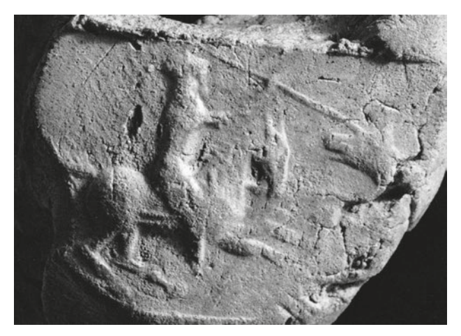
Fig. 9 - Seleucia-on-Tigris. Bulla with seal impression (after BOLLATI 2007, fig. 3d).

have been created by an artisan well acquainted with the western Iranian world and who was aware of its iconographic environment (and heritage ). Be that as it may, copies of such a prototype were quite likely made through our post-Mauryan terracotta mould in order to replicate, at Taxila in India, items bearing the imagery of Persian soldiers centuries after the empire's end. The mould imagery, emerging in post-Mauryan, possibly Graeco-Bactrian, Taxila, certainly had iconographic Achaemenid forerunners. It is an "echo" of the past, possibly a small but significant datum on the persistence of Persian themes in the arts and crafts of Asia. 41 Such Achaemenid resilience in