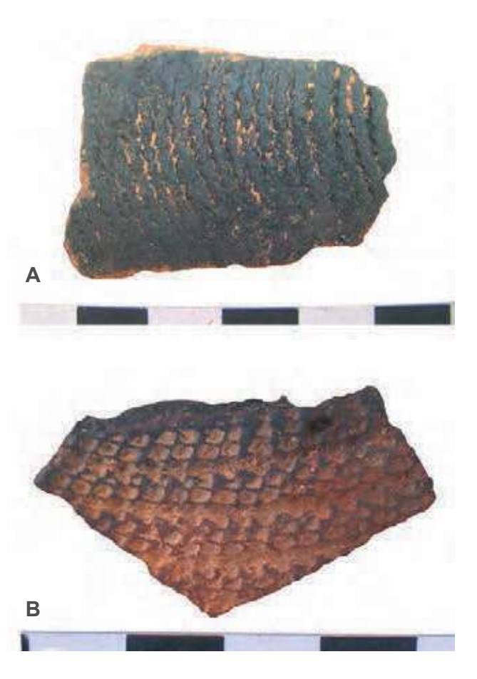
Figure 105. A, body sherd from WG 65, A4-5, SU46; B, body sherd from WG 39, Cave 3, A10, SU11.