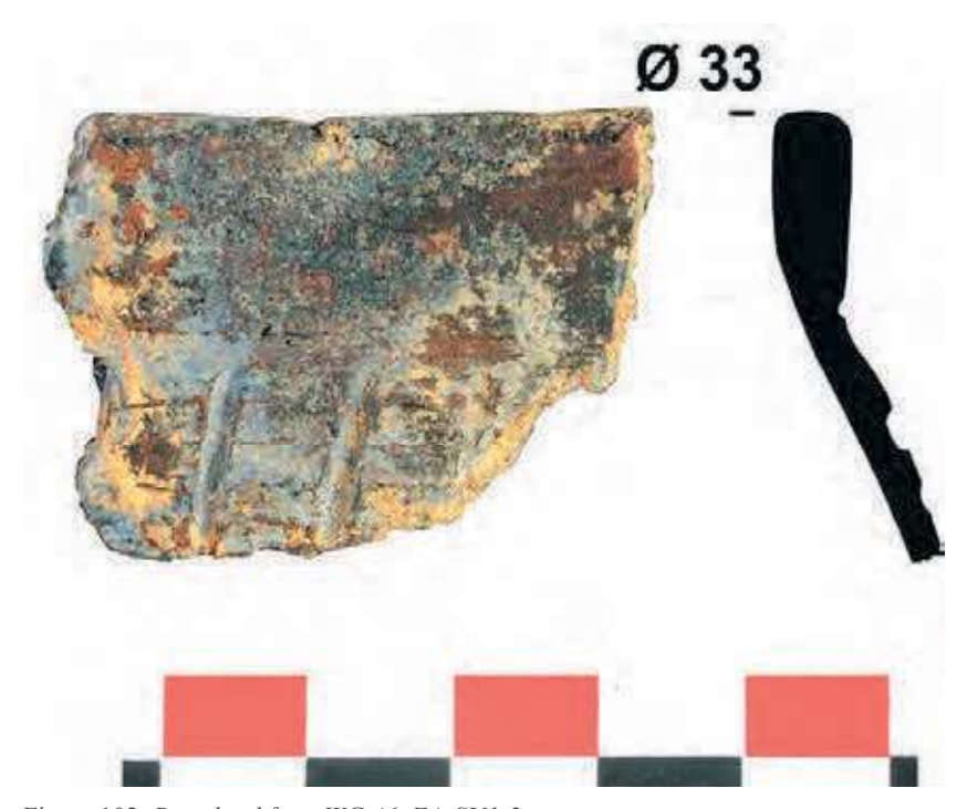
Figure 102. Rim sherd from WG 46, E4, SU1-2.