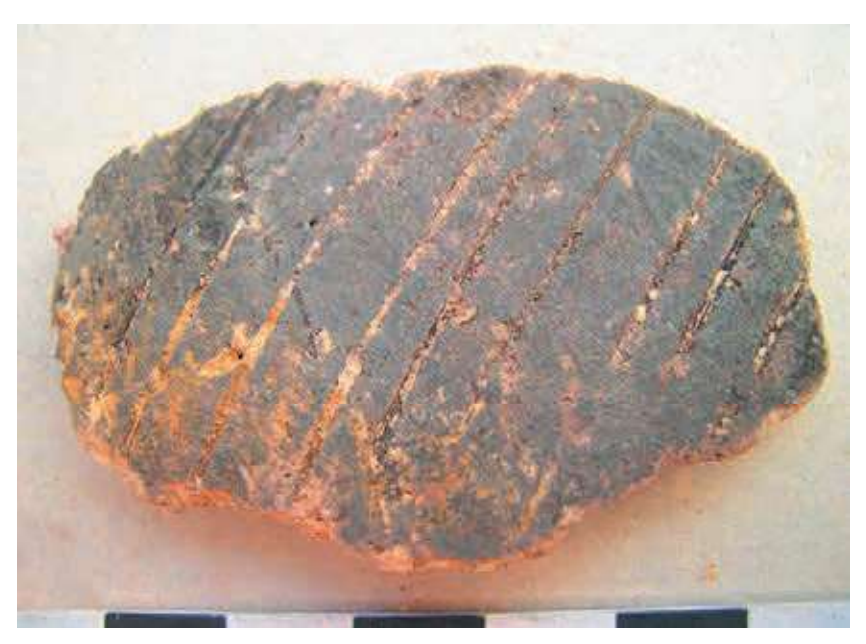
Figure 100. Body sherd from WG 66, D-E3, SU3.