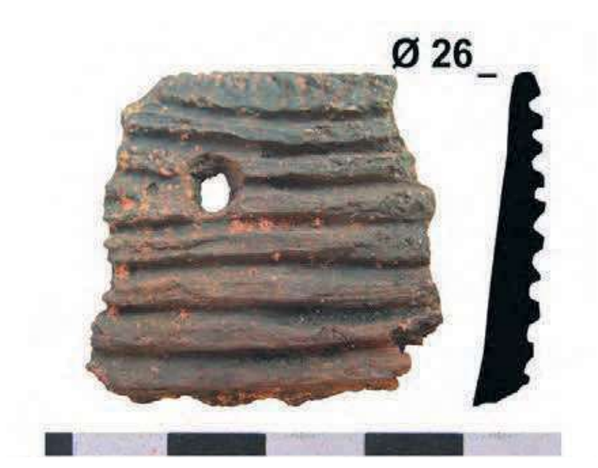
Figure 99. Rim sherd from WG 61, D-E2, SU45.