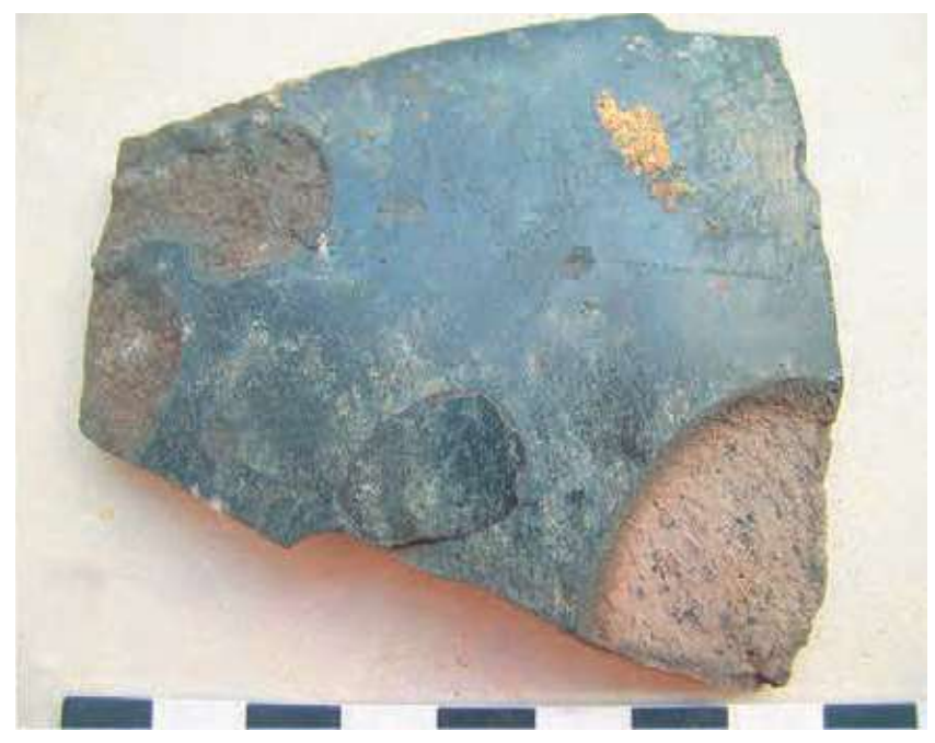
Figure 103. Body sherd from WG 68, SU1.