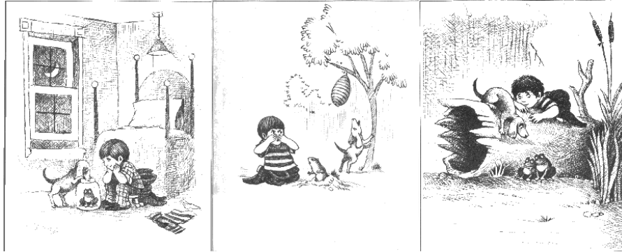
Figure 1. Picture 1, 10, and 22 of the book Frog, where are you? (Mayer 1969)

The Frog story was first used by a student of Dan Slobin, Michael Bamberg, to carry out research on the acquisition of narratives among German children (Bamberg 1987). Since the publication of Berman & Slobin’s (1994) crosslinguistic study, elicitation using the Frog Story has also been adopted in the field of documentary and descriptive linguistics, for three reasons. First, by using visual stimuli, it is possible to exclude possible linguistic interference (of e.g. a second language) when eliciting data. Second, a picture story book such as the Frog story potentially elicits a monologue in which clauses are connected. Third, using the same Frog story as stimulus enables crosslinguistic comparison of such stories across the fields of documentary and descriptive linguistics and typology. The Frog story began to be used for descriptive linguistic purposes in the late 1990s; one early mention of it being used for that function is Himmelmann (1998), while it also appears in later handbooks for fieldwork (Bowern 2008; Chelliah & de Reuse 2011; Sakel & Everett 2012). One major disadvantage is that narratives obtained using visual stimuli are considered low in their degree of “naturalness”.