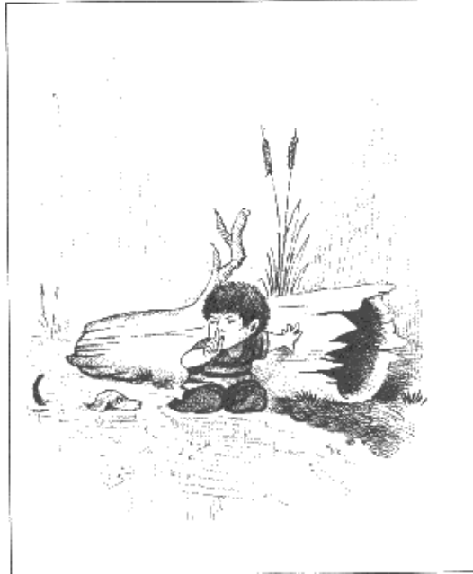
Figure 4. Picture 20 of the book Frog, where are you? (Mayer 1969)