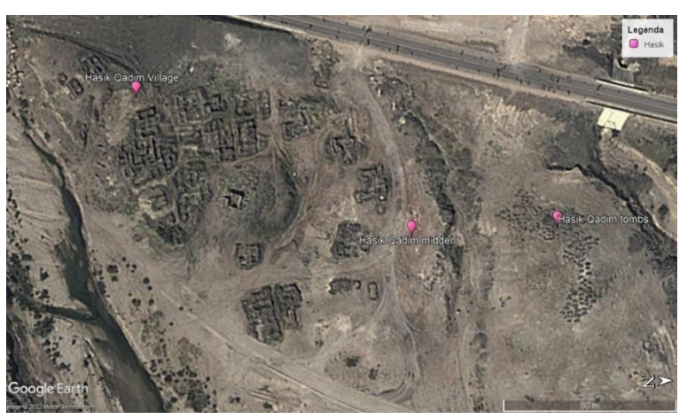
Fig. 6 - Hasik Qadim, satellite image (after Google Earth®) with location of the three main archaeological evidence

The village covers an area extending between 3 and 5 hectares (see Cleuziou, Tosi 1999) with stone houses consisting of several rooms, some single-