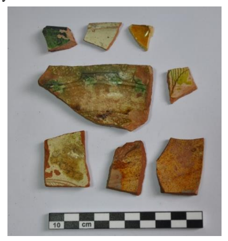
Fig. 9 - Hasik Siq, fragments of bowls in Sgraffiato ware, 13th century

beside some circular structures related to the storage and processing of fish noticed by Cleuziou, Tosi (1999, p. 14). Pottery sherds of Coarse Red ware, Local ware, Sgraffiato, Yellow or Turquoise glaze, Green glaze, Stoneware have been found (Figs. 9, 10). The very preliminary study of the materials allows proposing a chronological frame from 13th to 16th century, slightly later compared to the date put forward during the previous surveys. The cemetery located on a terrace south of the beach, was not documented during our survey.