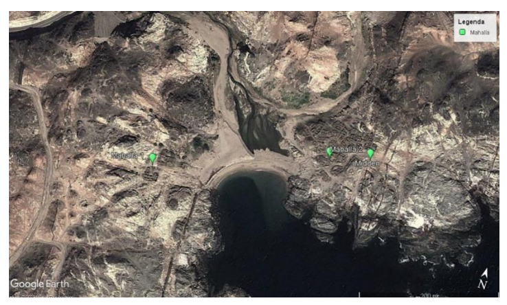
Fig. 12 - Mahalla, satellite image (after Google Earth®). Mahalla 1 on the left (eastern settlement); Mahalla 2 at the centre (western settlement); Midden on the right

Mahalla is the largest site among the ones surveyed and it is composed by three settlements: Mahalla 1, which occupies the eastern part of the site, far from the two other locations; Mahalla 2 which stands on the west, and Mahalla midden which is located on the eastern side of the settlement (Fig. 12). A wadi, forming a small and protected lagoon, divides the site in two parts. The largest number of ruins is concentrated at Mahalla 2 where the masonry structures reach a height of about 2m. The building material is the local dark granite worked in dressed and un-hewn masonry blocks. A circular tower has been recorded in the eastern portion of the Mahalla