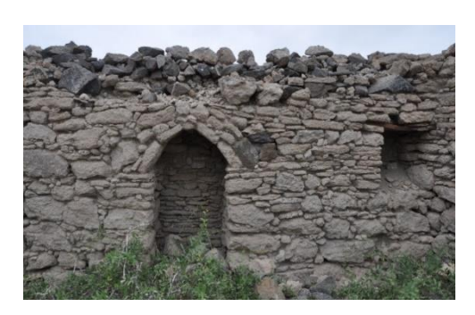
Fig. 7 - Hasik Qadim, the miḥrāb of the mosque

cell buildings to be interpreted as warehouses, and a mosque. A defined urban layout seems to be lacking. The elevations of the masonry compartments reach, and in some cases exceed, 2m. The construction technique is based on sack masonry which employs as building material irregularly hewn blocks, arranged in