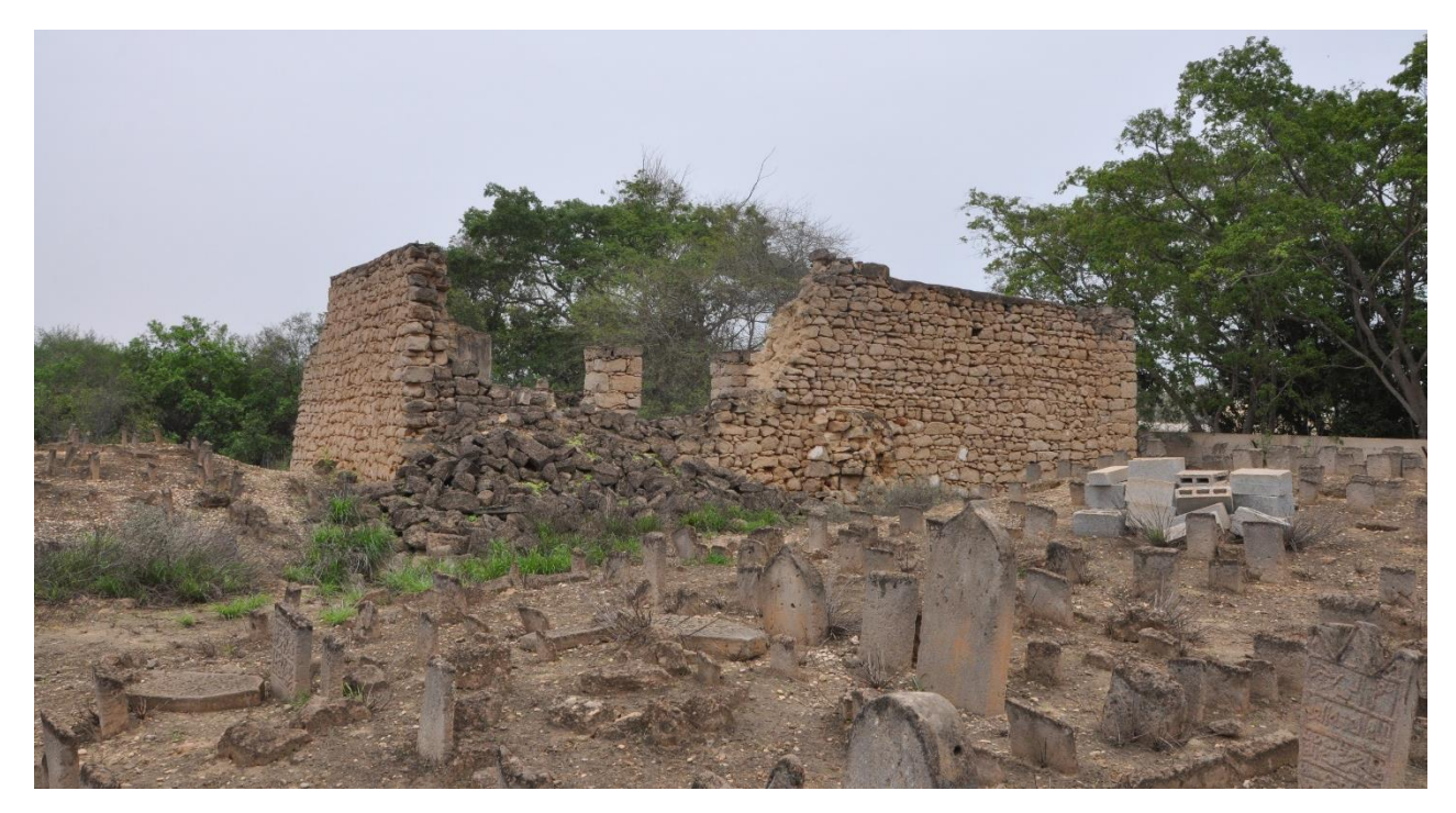
Fig. 4 - The mosque of Al Ribat; external view of the qiblī wall

carried out some study activities focused on this cemetery area. The cemetery area is very large and developed around a small mosque whose state of preservation is still identical to that documented by Costa in the late 1970s (1979, fig. 4, pls. 47a,b). It is a small mosque with a rectangular prayer hall divided into two naves by a row of three pillars that runs parallel to the qibl\bar{\iota} wall, and it was originally covered by a flat roof (Fig. 4).