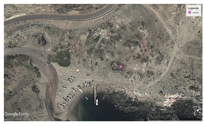
Fig. 8 - Hasik Siq, satellite image (after Google Earth®)

The site is located about 10km south of Hasik Qadim, directly on a beach facing the sea and sided by the lagoon made by wadi Attabarran. According to Cleuziou and Tosi (1999, p. 14) the site has the appearance of a proper archaeological mound, not easy to recognize today (Fig. 8). The archaeologists identified two construction phases: the older one consists of well-built dwellings made of four rooms, the more recent of less dense rectangular or circular structures. A number of boat-shaped tombs, littered by fragments of sea shells, and a possible well have been documented at the site,