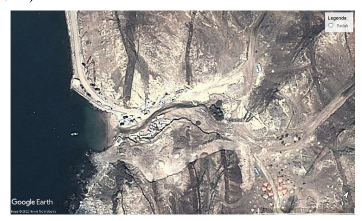
Fig. 11 - Sadah, satellite image

Sadah is a small sheltered harbour with good anchorage that today, 10 as in the past, has benefited from fishing-related resources. Unfortunately, nothing of the ancient site survives (Fig. 11), but traces of the use of an old quarry are still evident in the area of harbour. A number of ancient structures, which were photographed in 2004 by one of the authors, have been completely destroyed and any trace is today visible. Albright (1982, p. 81) in the 1950s, was the first to conduct an exploration, albeit limited, of the site. He reported an ancient village built from the "water's edge along both sides of the