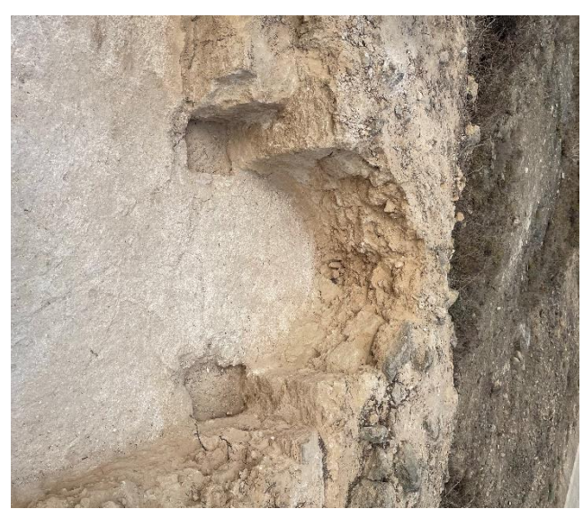
Fig. 2 - The mihr\bar{a}b of the mosque

A floor was found in the area in front of the mihr\bar{a}b consisting of a thick layer of white plaster, well levelled and perfectly preserved from the niche and up to the southwest