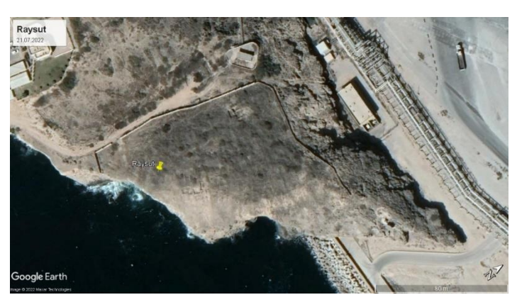
Fig. 13 - Raysut, satellite image of the archaeological area fenced by a modern wall

Raysut was the only site we visited along the coast west of Salalah. The site is located on the top of the promontory which overlooks Ras Raysut, the area which corresponds to the actual Salalah port, about 30m on the seaside. It is currently fenced by a wall provided of a gate (Fig. 13). Phillips (1972, pp. 158-161) conveys information about the presence of a wall with a defensive function — of which scanty remains were visible on July for the abundant vegetation —, built along the west and south sides, but absent along the overhang to the east. He also reports that the dwellings, simple in plan, were made