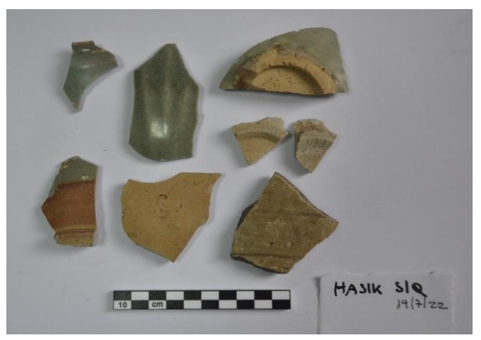
Fig. 10 - Hasik Siq, fragments of vessels in Stoneware, 14th-15th century