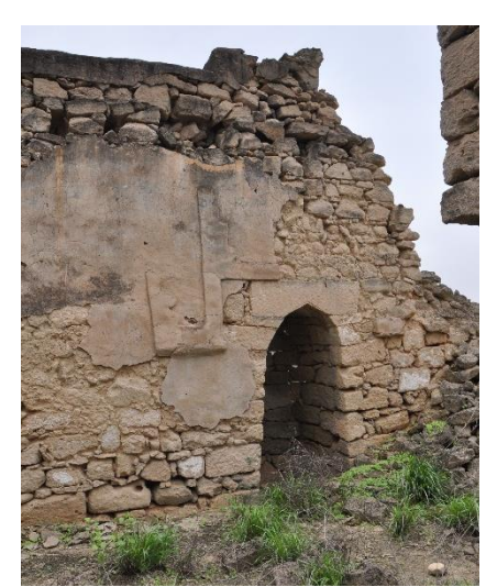
Fig. 5 - Al Ribat mosque: the miḥrāb

In Mirbat, about 100km east from Salalah, the mausoleum of Bin Ali al-Alawi and the associated cemetery was the subject of a short preliminary visit. It is a shrine with two domes,<sup>7</sup> in an excellent state of preservation, dedicated to a shaykh from Hadramawt, died in 556/1160. The monumental tomb bears two stelae, one in wood on the north side,