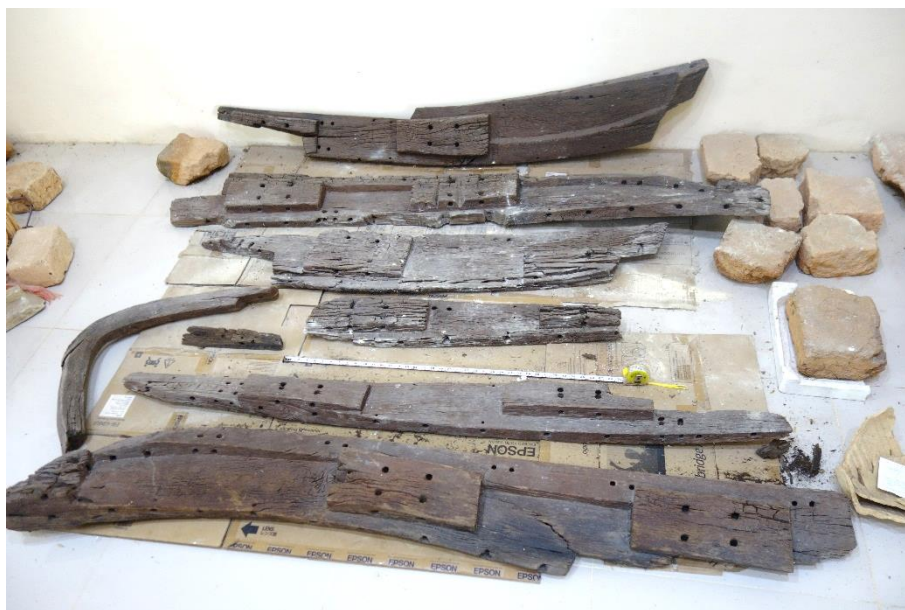
Figure 1.2 Dismantled planks and frame from Sukaraja site in the storage of Bumiayu temple compound.

Iconography is highly useful for its complete depiction of ships and boats, unlike archaeological remains (Grossmann, 2019). However, it must be treated with caution because the images are merely representations, rather than the actual vessel itself. They are heavily influenced by the creator's background, including their culture, skills, and education. The media used also plays a significant role in how the representation comes to be; many differences with the original could appear as the result of transferring a three-dimensional object to a two-dimensional media (Wachsmann, 2019). Other factors to consider include the audience, dissemination, and consumers of such images (Loren & Baram, 2007).