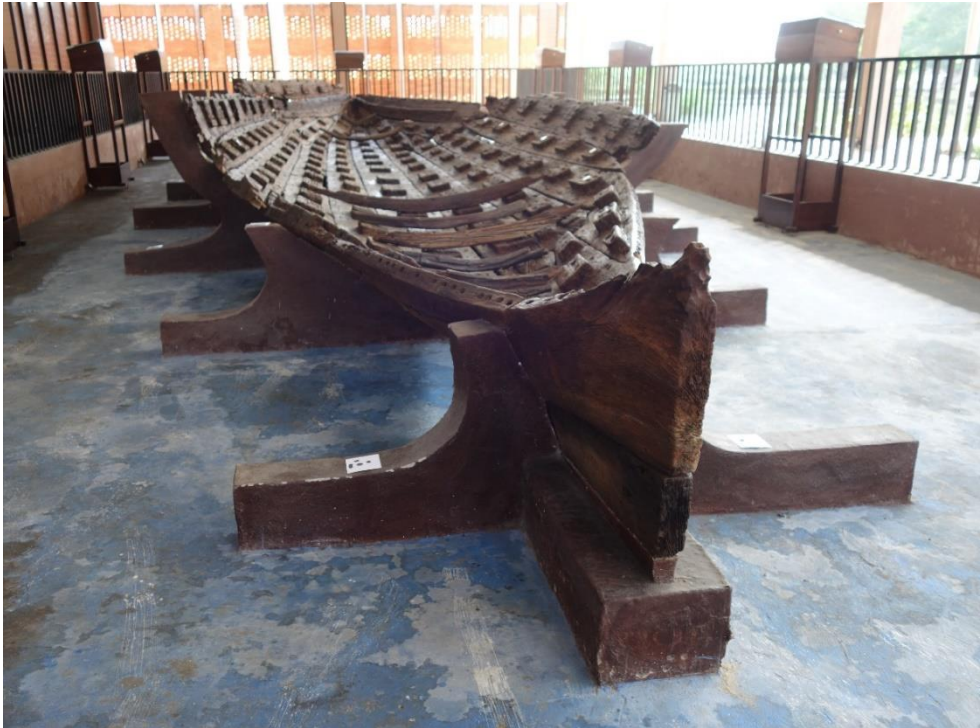
Figure 1.1 Punjulharjo boat in Rembang, Indonesia. One example of a lashed lug vessel found intact.

one site (Lacsina, 2019) or to a few sampled sites (Lacsina & Komoot, 2023; Lacsina & Mochtar, 2020). The reasons behind these commonalities and variations remain an open debate to this day, awaiting more in-depth research.