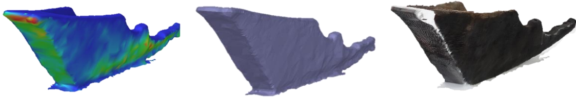
Figure 1.4 A wing end from the Bongal site presented in different models in Agisoft Metashape program.

on darker timbers. Therefore, the author also manually measured and recorded such details through sketches and field notes.