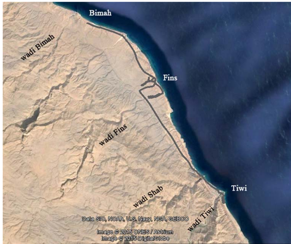
Fig. 1 - 2015 survey area