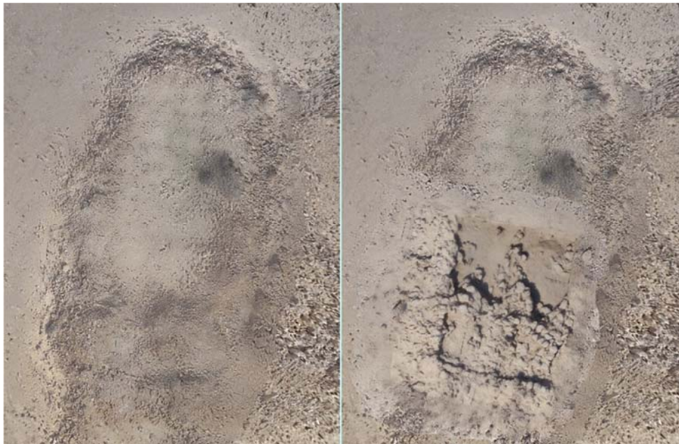
Fig. 2 - The hut at the beginning of the excavation (left) and at the end (right). Ortho-restitution of a Photogrammetric 3D photographic mapping