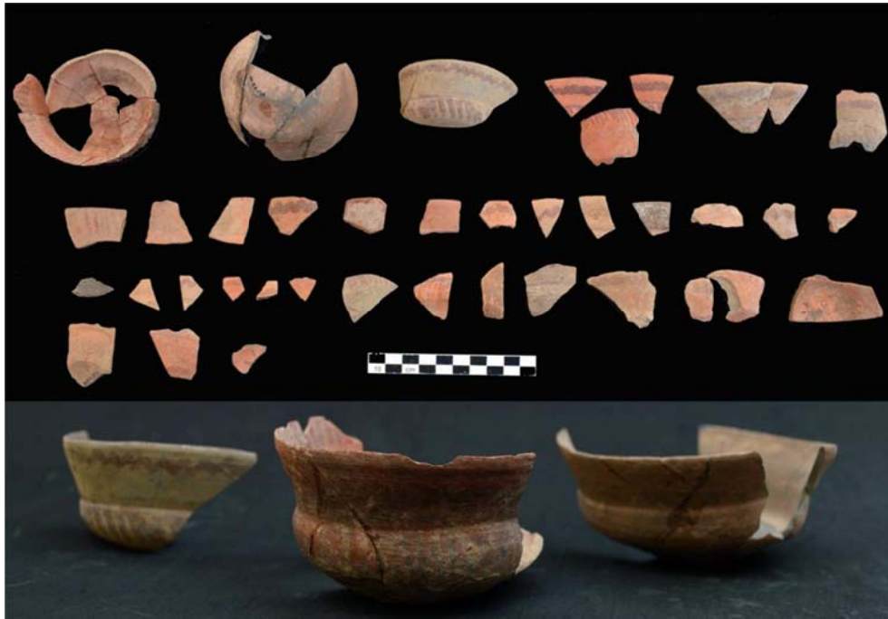
Fig. 4 - Iron Age II pottery items for food consumption