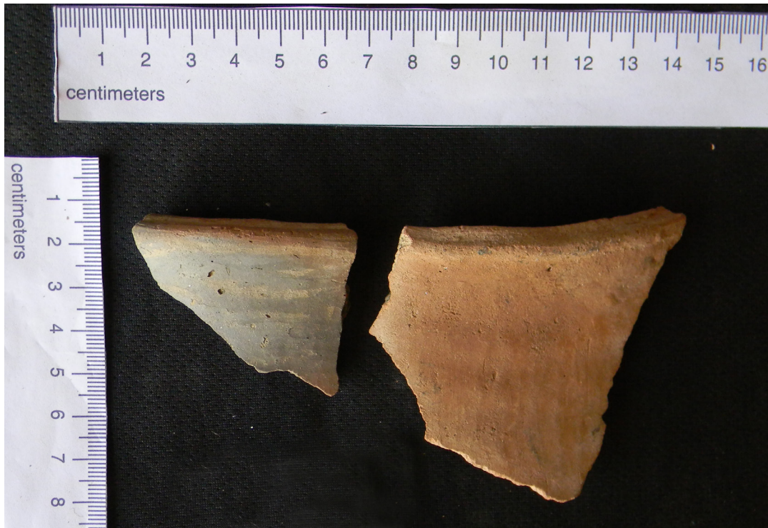
Fig. 8: Fragments of orange-red micaceous ware bag-shaped Adulitan jars.