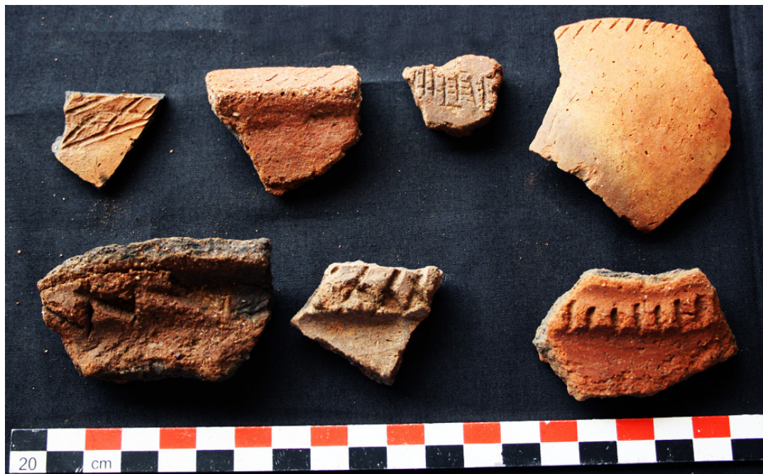
Fig. 9: Fragments of red-brown micaceous and organic tempered ware Adulitan bowls with incised rim, jars or bottles with incised moulded ledges on the shoulders.