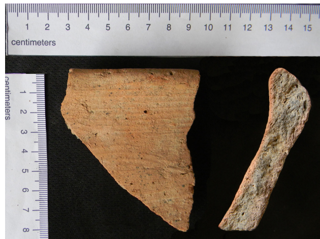
Fig. 12: Large orange-red micaceous ware rim sherd of a jar with scraped external surface.