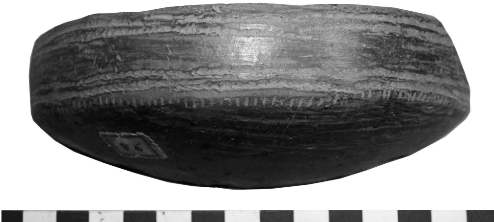
Fig. 3: Fragment of a black-grey polished mineral and micaceous Adulitan carinated bowl with decoration along the rim and the carina possibly obtained by impressing the edge of a shell on the wet paste (Paribeni collection, National Museum of Asmara).