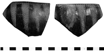
Fig. 6: Wavy outline impression, possibly obtained by impressing on the wet paste the edge of a shell (Paribeni collection, National Museum of Asmara).