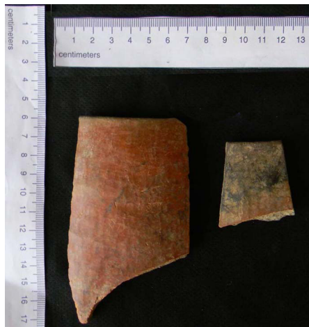
Fig. 11: Black-topped beakers.