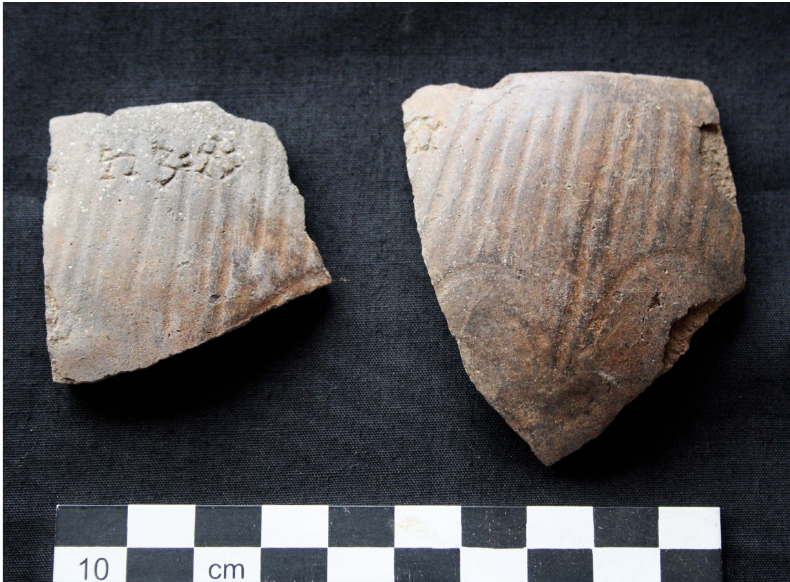
Fig. 10: Rim sherd of brown mineral tempered ware red slipped closed cup with vertical grooves and a cross and a Ge'ez inscription under the rim.