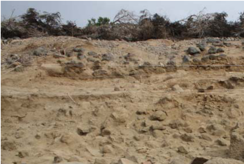
Fig. 2: Sector 1, view from south of a collapsed wall from the latest occupation phase.