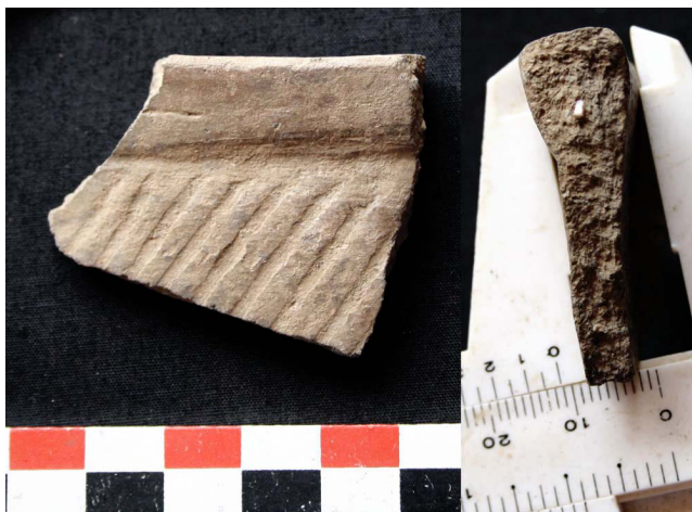
Fig. 5: Rim sherds of Adulitan black-grey micaceous ware bowl with flat triangular in section rim, decorated with oblique incisions on the external surface.