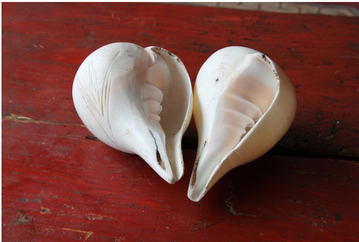
Photo (5) The white conch-shells held by the 'cham dancer at Ting kya monastery.