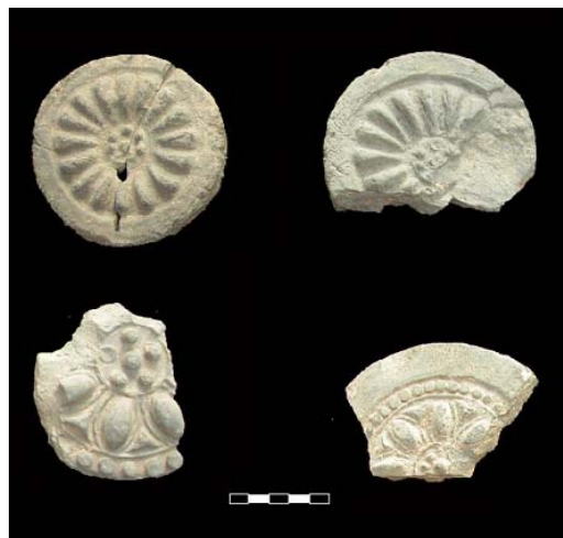
Fig.8 - tile-ends with lotus flower decoration.