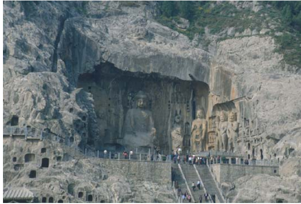
Fig.1- Longmen Caves. Fengxiansi Shrine.