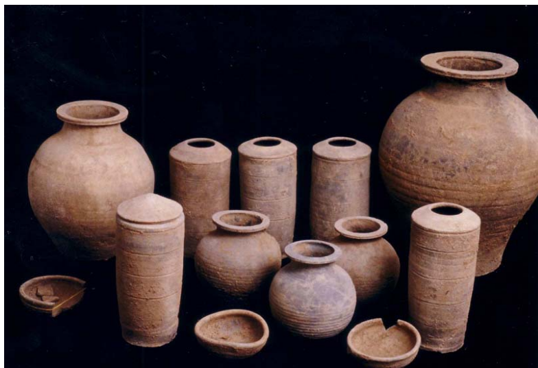
Fig.3 - site of the Fengxiansi. Grave goods of the Eastern Han tomb.