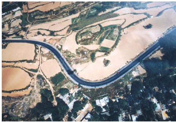
Fig.2 - site of the Fengxiansi. Aerial view before excavation.