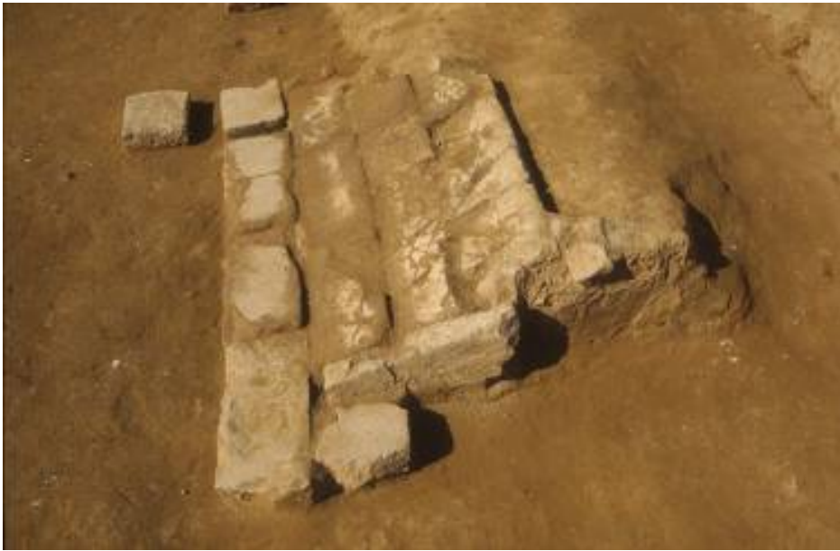
Fig. 6 - site of the Fengxiansi. Ramp giving access to the east hall.