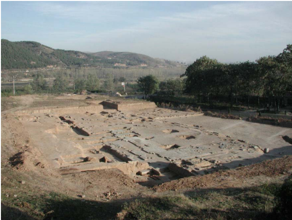
Fig.4 - site of the Fengxiansi. General view of the excavated area with the central hall.