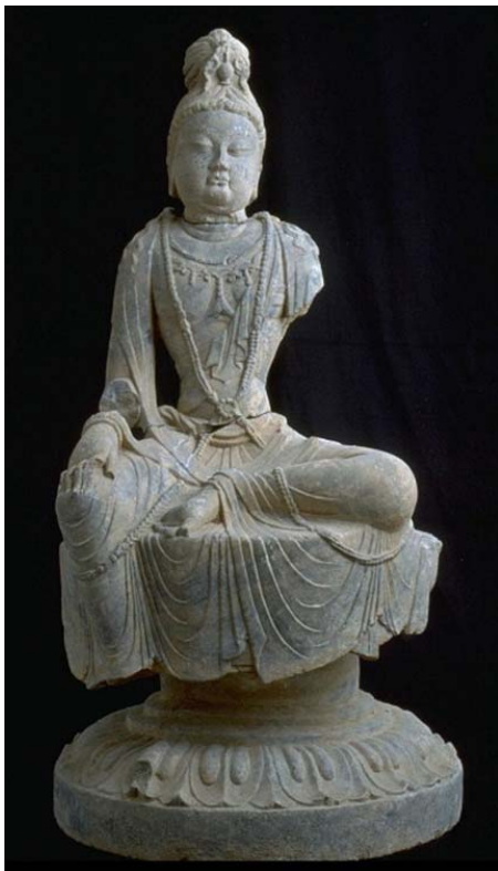
Fig.7 - site of the Fengxiansi. Statue of Mahastamaprapta.