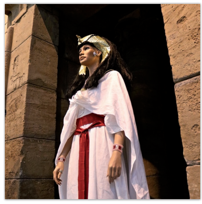
A reconstruction of the costume of Queen Nefertari was prepared at Leiden University for the exhibition.