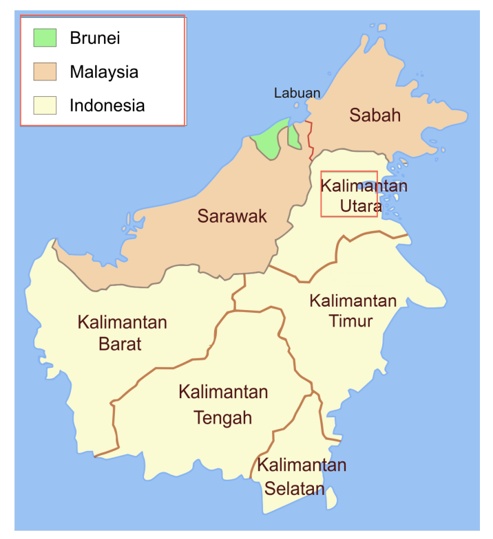
Figure 2. Map of Borneo

which they have close historical relations. While they speak the language of the group with which they have settled, the members of these sedentary groups do not typically speak Punan Tuvu'. With the spread of Indonesian as a national language, Kenyah and Punan speakers also communicate with neighboring populations in Indonesian. In certain official contexts Indonesian is also used between Punan speakers. Punan Tuvu' is classified as a separate branch belonging to the North-Sarawak subgroup. Figure 2 shows the approximate location where the languages discussed in this paper are spoken.