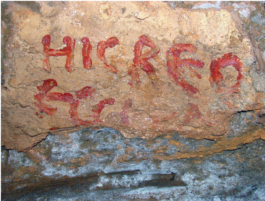
FIGURE 8 Epitaph no. 32

assuming that the second letter at l. 1 is an S written with the Greek C. 9