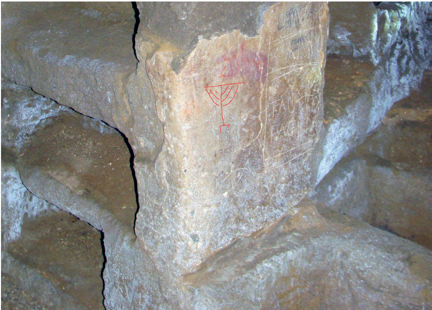
FIGURE 11 Same of fig. 10, with menorah highlighted