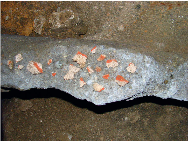
FIGURE 7 Epitaph no. 31