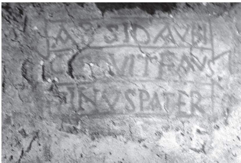
FIGURE 3 Epitaph no. 15

Still in situ , but l. 1 is lost. This inscription, originally divided into three lines, is painted in red on a tabula ansata that is placed on the outer face of the left wall at the arcosolium opening, towards the upper right corner, just above a large nine-branched menorah. This is the first arcosolium of the Faustini (the other one being D7; see Williams 1999: 46). As is well known, this inscription is not the real epitaph of Faustinus (which is inside the arcosolium, no. 19), but just its “signpost”, as said by Noy. The inscription is well-preserved and has long been fully readable, but JIWE does not mention that it actually lacks the first line (with the words ABSIDA VBI) due to the vault’s having been lowered, apparently shortly before 1989, as declared in a note (“la prima riga è stata coperta di recente”) on a photograph taken that year within the framework of the ARS project “Presenza ebraica in Italia” (Jewish Presence in Italy). 8 A good, though unpublished photograph of this inscription, while still untouched, was taken by Colafemmina in the early ’70s (Fig. 3).