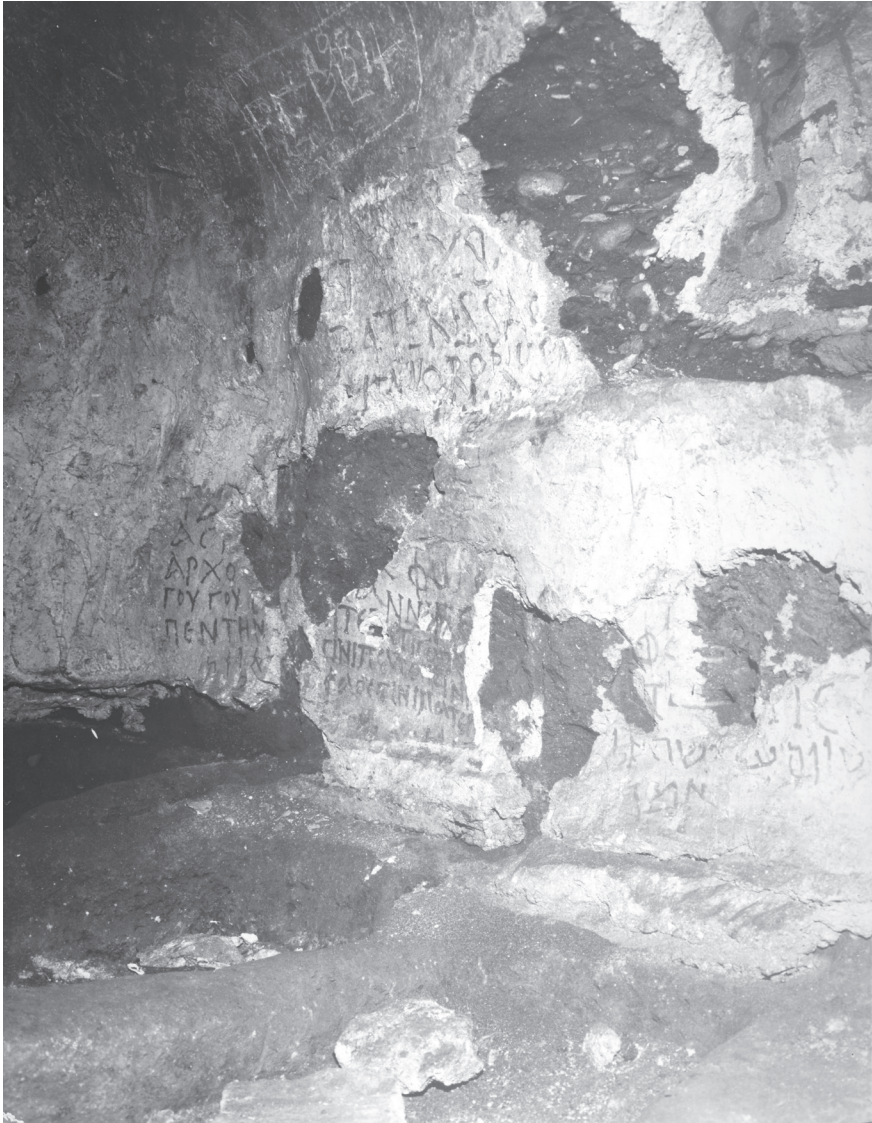
FIGURE 5 Epitaphs nos. 19–21