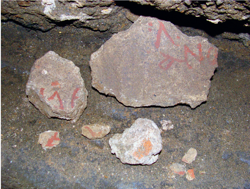
FIGURE 9 Fragments of epitaph no. 36

ground, while 7 or more are in monosome or bisome arcosolia in the lateral walls. For the graves in the ground, the arrangement of the epitaphs, always westwards (right side) and then close to the heads of the bodies, does not exactly follow the irregular alignment of the graves. Particularly from graves 5 to 8, there are more inscriptions than graves, and the relationship between each epitaph and the underlying tombs is not yet certain. There is, moreover, considerable confusion, both in 19th-century reports and in later literature, about the positions of the epitaphs, which sometimes appear to be wrong.