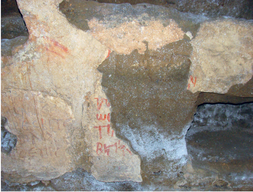
FIGURE 4 Epitaph no. 18