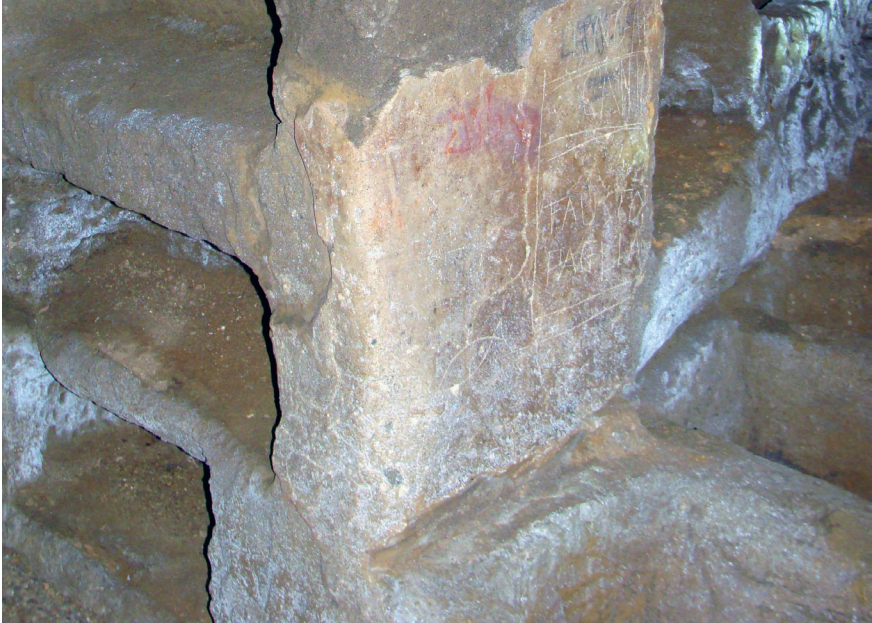
FIGURE 10 Arcosolium D7, opening, left wall: Hebrew shalom , ancient menorah and modern graffiti