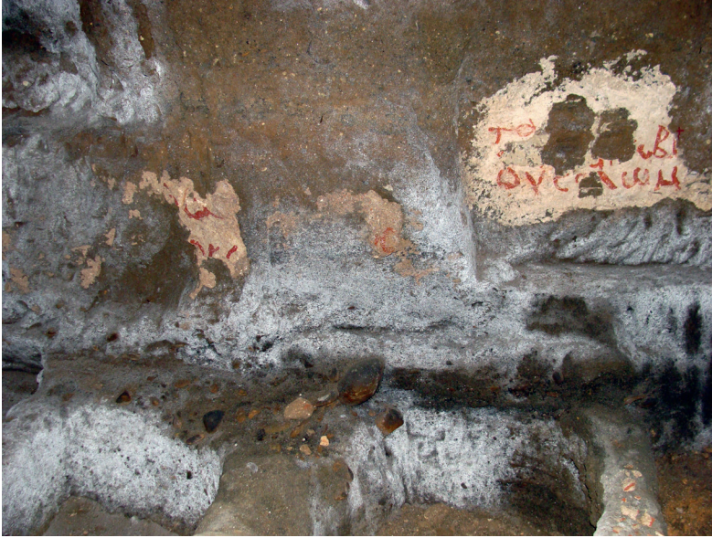
FIGURE 6 Epitaphs nos. 29–31