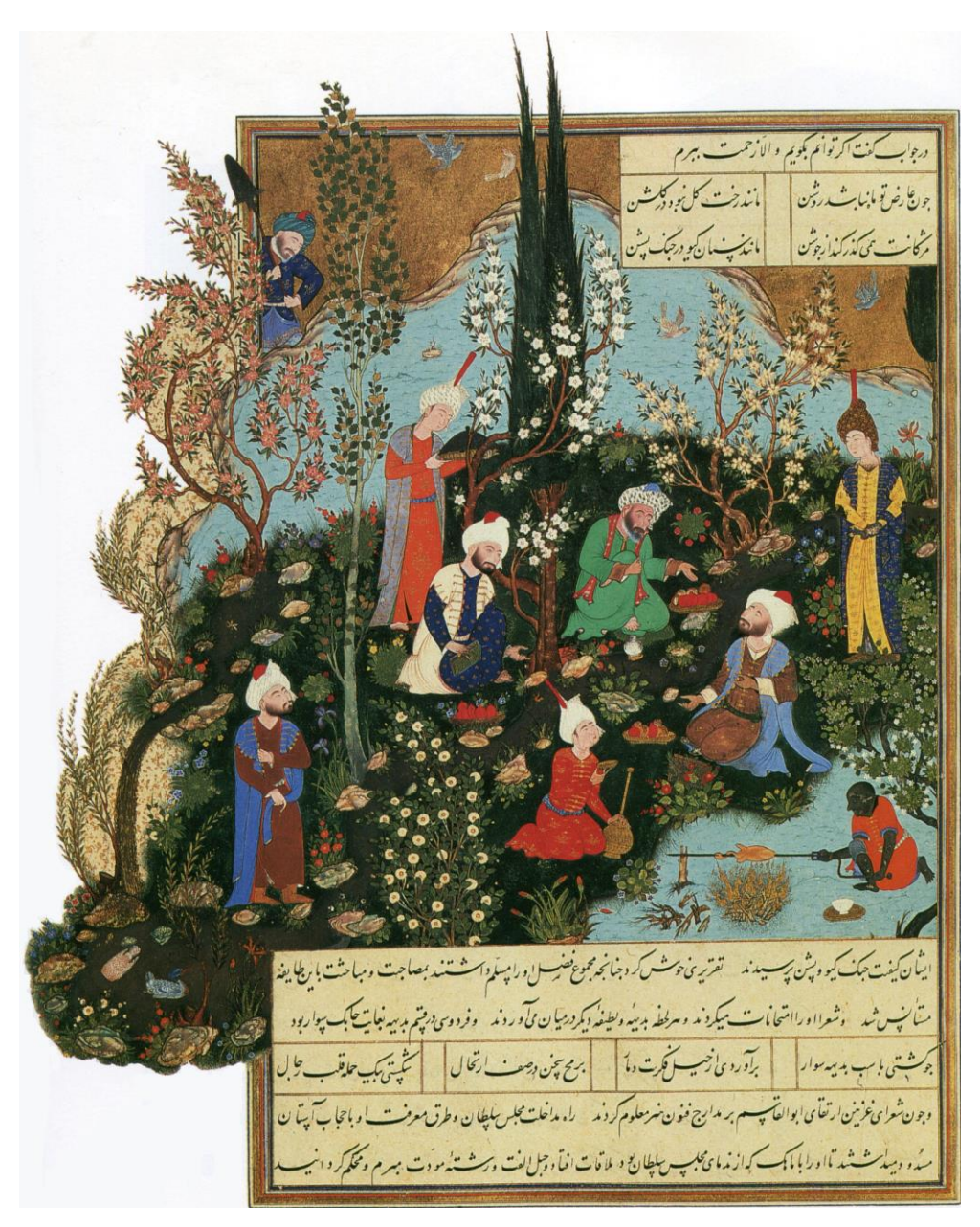
Fig. 2 - "Firdowsī meets the Ghaznavid court's poets 'Unṣurī, Farrukhī and 'Asjudī', Firdowsī's Shāhnāma , Iran, 1535, Toronto, Aga Khan Museum, Ms. AKM 156 (ex M185), fol. 7r (after Bahari 1996, fig. 117).