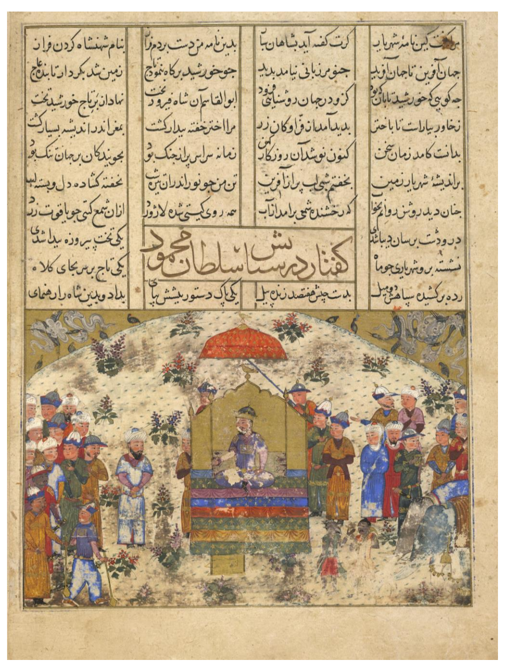
Fig. 1 - "The enthroned sultan Maḥmūd of Ghazni", Firdowsī's Shāhnāma , Iran, 1446, London, The British Library, Ms. Or. 12688, fol. 15v.