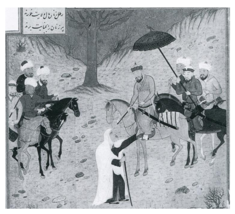
Fig. 3 - "Sultan Sanjar and the old woman", Niẓāmī's Khamsa , Herat, 1494-95, London, The British Library, Ms. Or. 6810, fol. 16r (after Bahari 1996, fig. 72, detail).