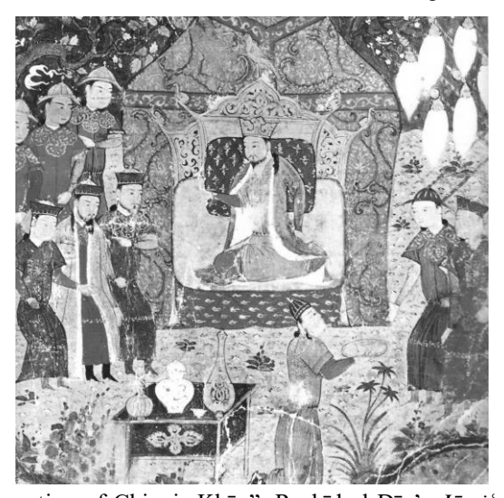
Fig. 4 - "The proclamation of Chingis Khān", Rashīd al-Dīn's Jāmiʿ al-Tawārīkh , Herat, 1430, Paris, Bibliothèque nationale de France, Supplément persan 1113, fol. 44v, detail (after Blochet 1929, pl. LX).