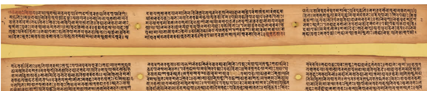
Top right: Front page detail of the Tamil commentary on the Śivadhamottara. Above: Nepalese manuscript of the Śivadharma corpus.