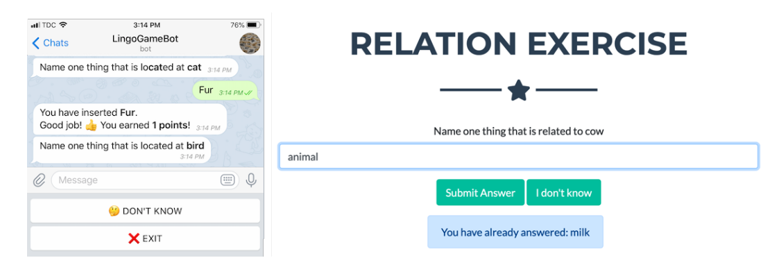
Figure 2 A screenshot depicting the two prototype implementations, i.e., the Telegram chatbot (left) and the Bootstrap web application (right) where a user is contributing new words, while completing exercises.