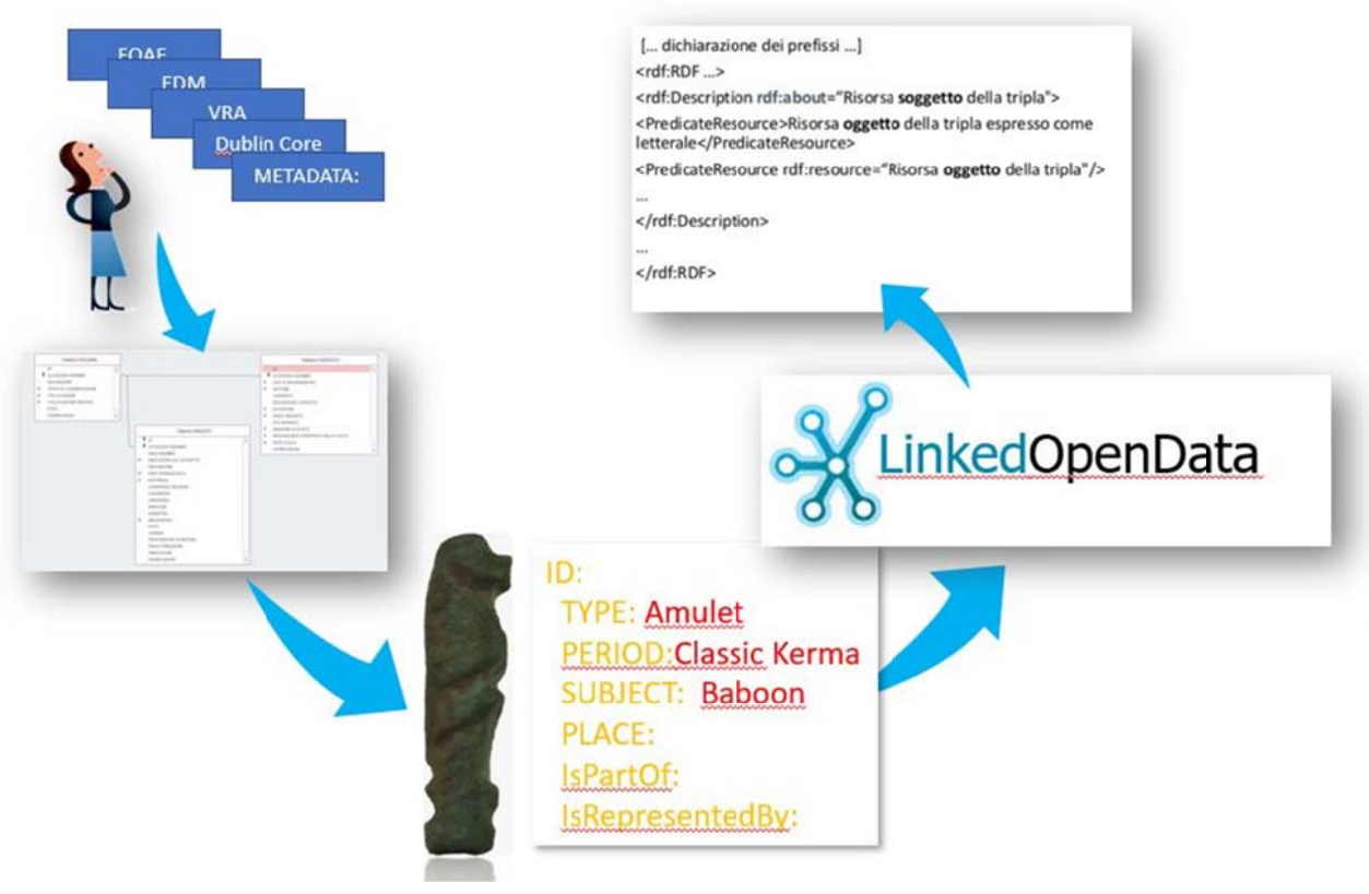
Fig. 6 - The workflow process of The amulets of the Kerma culture project