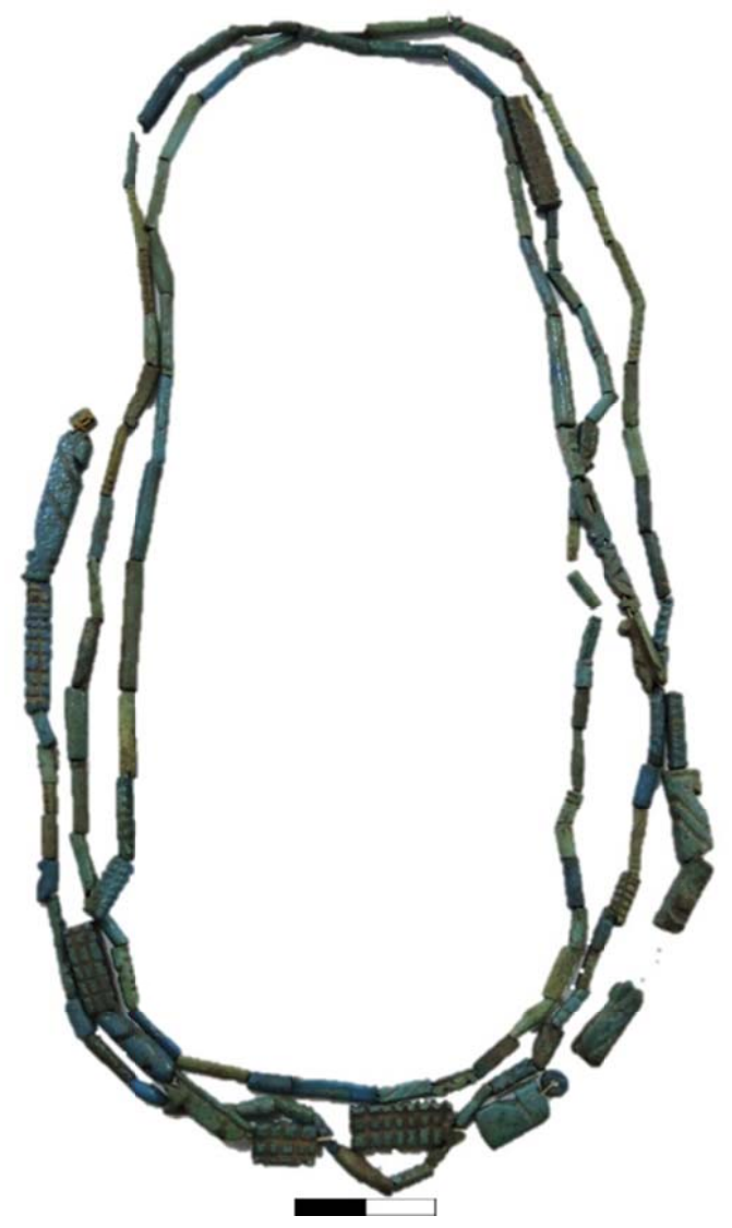
Fig. 2 - String of faïence beads and amulet-beads representing baboons (6), ladders (4), Tawret (16), and one hand, found in the Eastern cemetery of Kerma, tomb K 311 (NMS 1004)