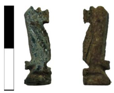
Fig. 5 - Amulet-bead representing Tawret, found in the Eastern cemetery of Kerma, tomb K 1600