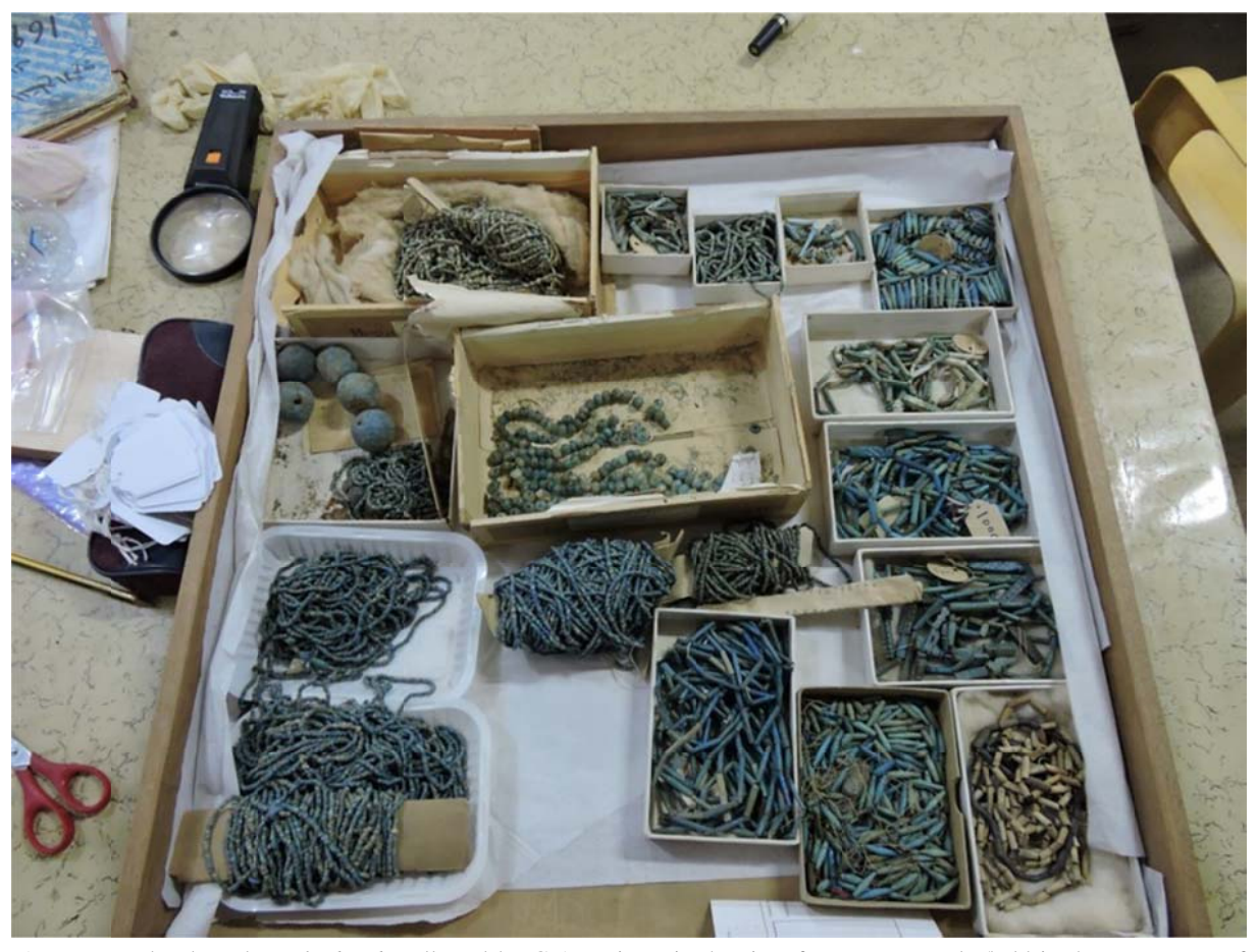
Fig. 1 - Fa\"{i}ence beads and amulet-beads collected by G.A. Reisner in the site of Kerma currently held in the storerooms of the National Museum of Sudan, Khartoum