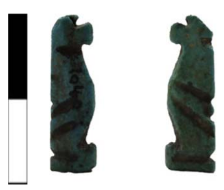
Fig. 4 - Amulet-bead which shows a baboon, found in the Eastern cemetery of Kerma, tomb K 1604 (NMS 1040)