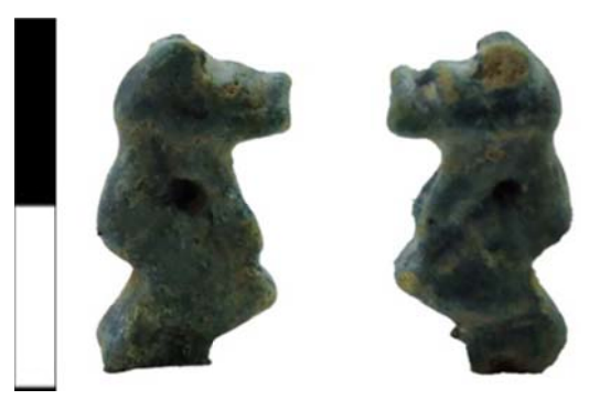
Fig. 3 - Amulet representing a hippopotamus in faïence, found in the site of Saras (NMS 22596)