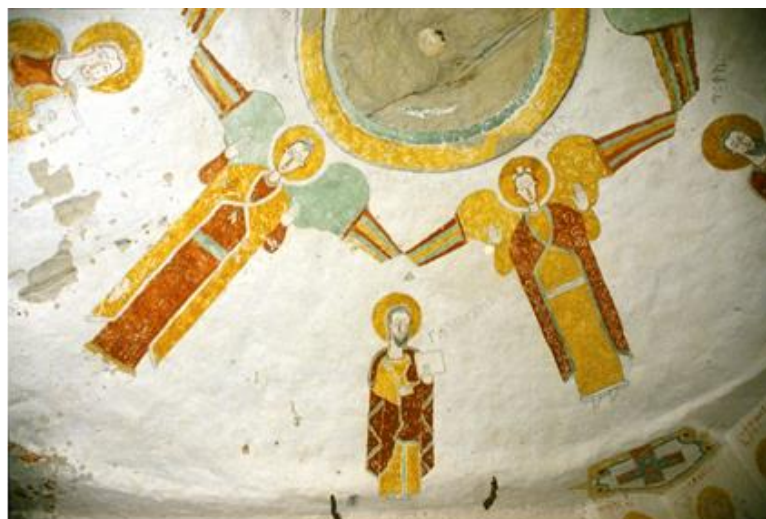
Fig. 10 – Evangelists and Archangels, Oratory of Qorqor Danə'el, 14 th –15 th century