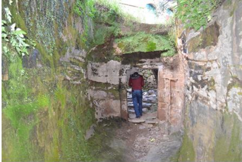
Fig. 7 – The trench leading to the Church of Gäbräʾel Wäqen, 15 th century (?)