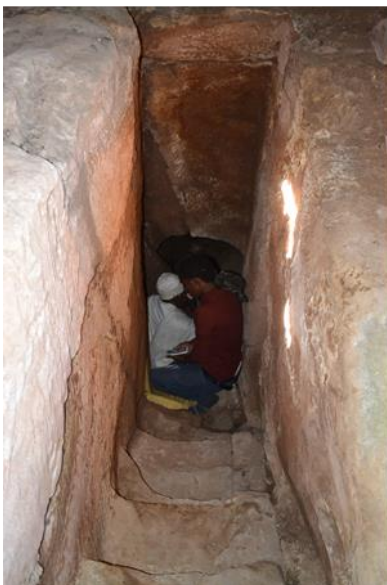
Fig. 3 – The entrance to the hypogeum of Gäbräʾel Wäqen