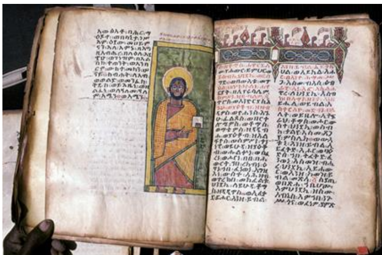
Fig. 9 – Portrait of the Apostle Thomas next to the beginning of his Acts, Apocryphal Acts of the Apostles, Däbrä Šärabi, 14 th –15 th century, ff. 132v-133r