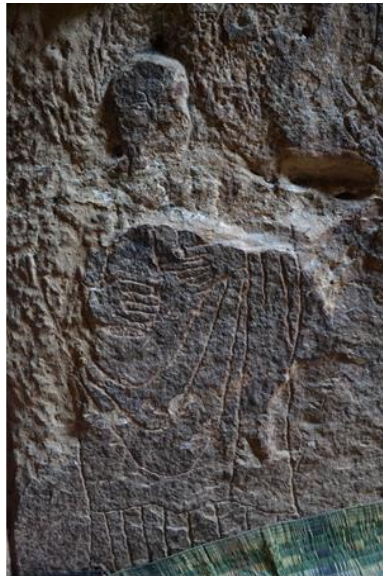
Fig. 1 – An unidentified saint, Gəbrə'el Wäqen, 15 th century (?)