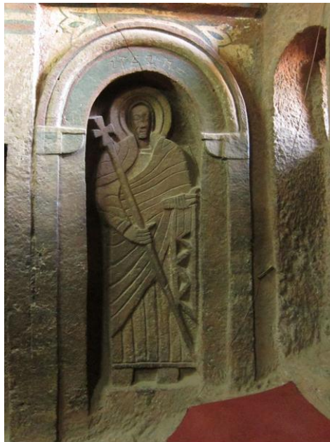
Fig. 8 – Carved figure from Betä Golgota, 12 th –15 th century (?)