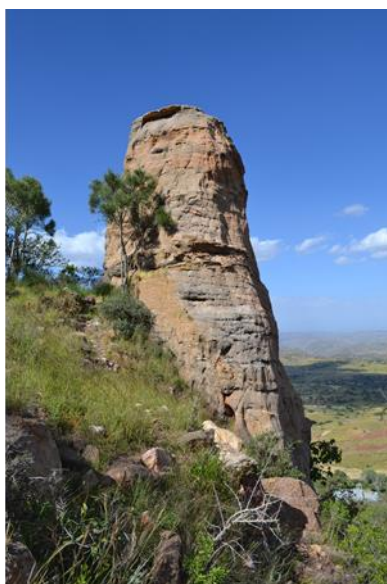
Fig. 4 – The pillar used for prayer by Danəʾel of Wäqen