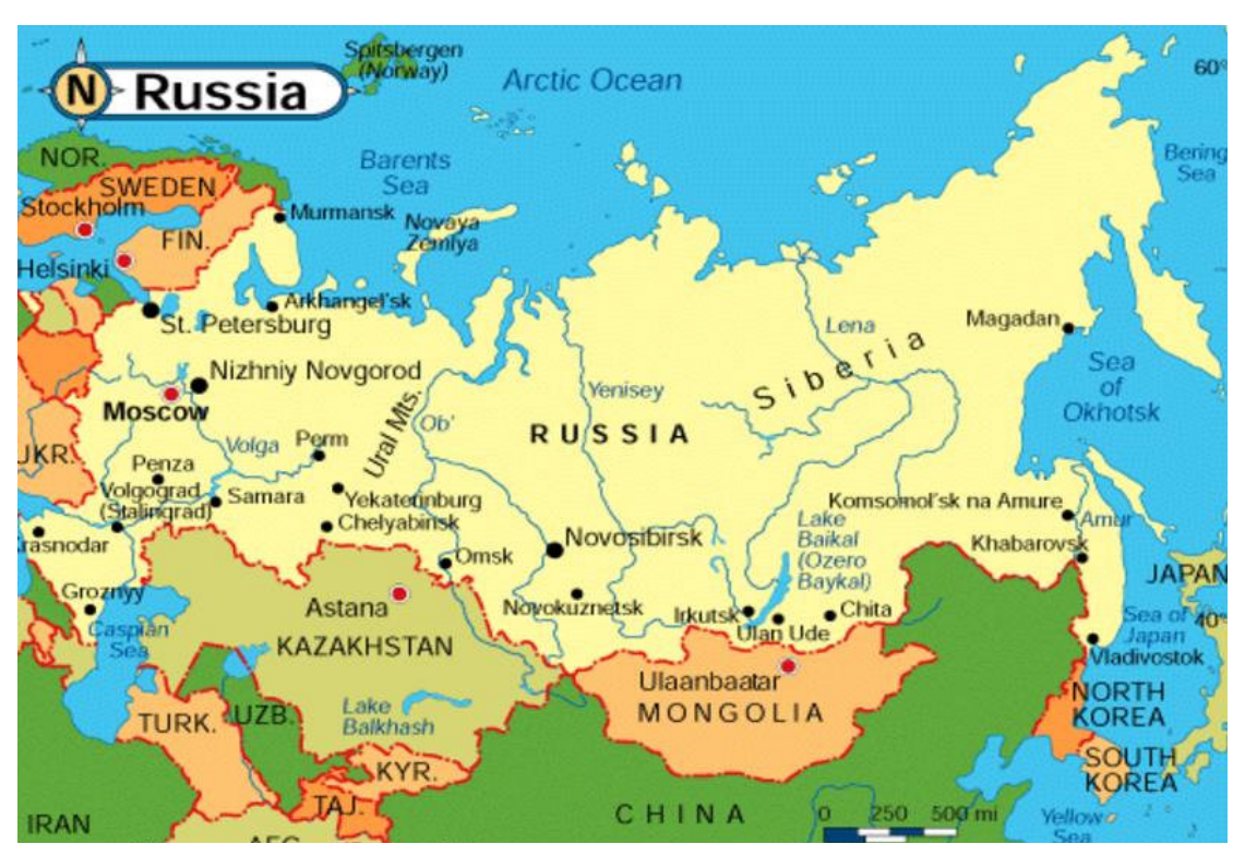
The map of Russia (Buryatia sitiated to the east and south of Lake Baikal, to the north of Mongolia)