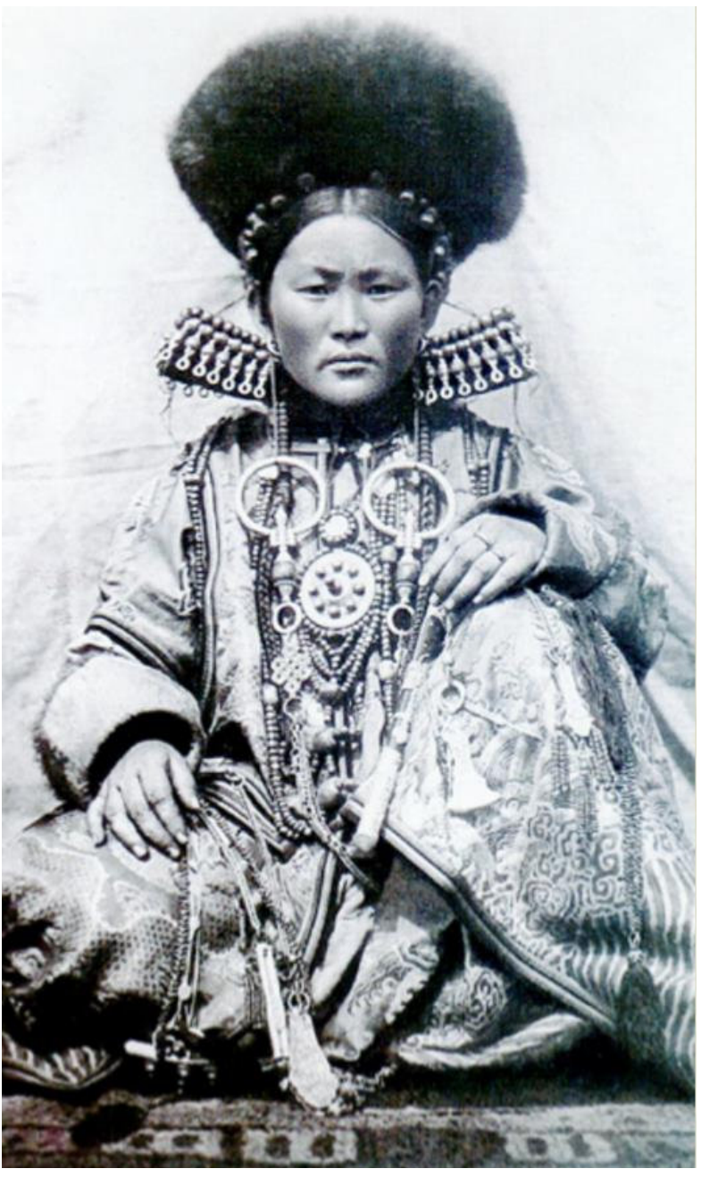
The Buryat woman of the Khori tribe (The end of 19th century, photo of A. K. Kuznecov in Chita)