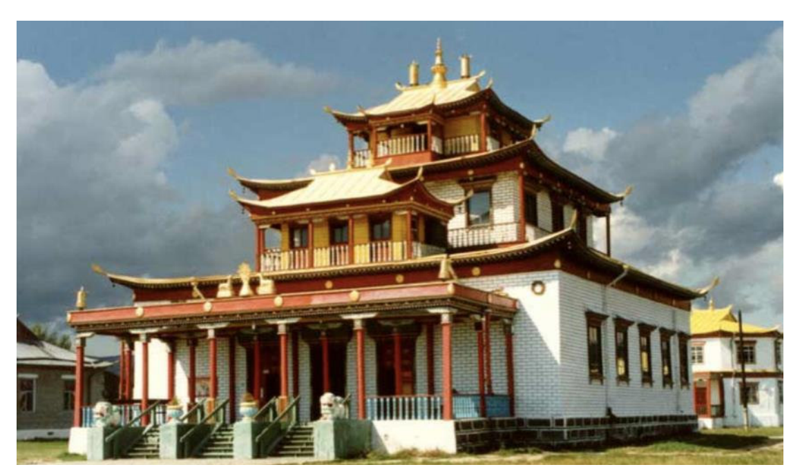
Dacan of Ivolga (The Buddhist centre of Russia, which was built in 1947 as a museum 40 kilometers south of Ulan-Ude)