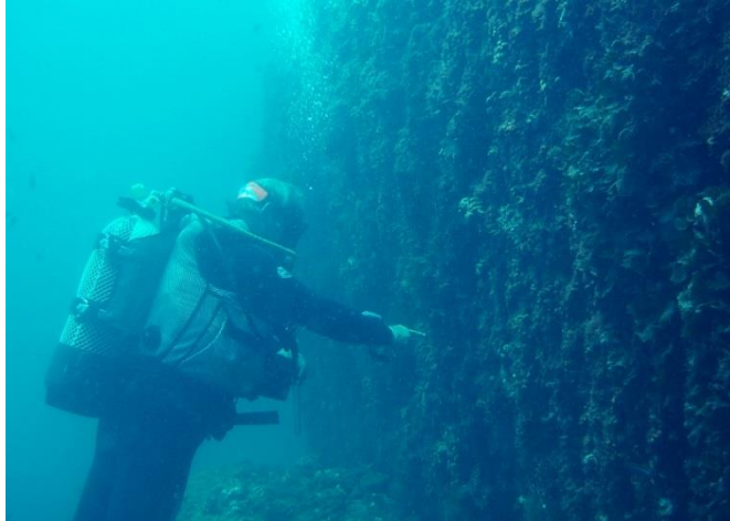
Fig 1. A diver in front of a huge pila at the Secca Fumosa, in the Phlaegrean area.

thus formed. Walls which are to be under water should be constructed as follows. Take the powder which comes from the country extending from Cumae to the promontory of Minerva, and mix it in the mortar trough in the proportion of two to one.” [Vitr. 5.12.2]