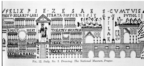
Fig 2. A glass flask depicting the waterfront of Puteoli, with the indication of the PILAE (Ostrow, 1979).

be easily seen in the representations of the nineteenth century, were still visible, on the surface of the water, until the early twentieth century, when the great modern pier of Pozzuoli was built on top of them (Castagnoli, 1977; Dubois, 1907) (Fig.3).