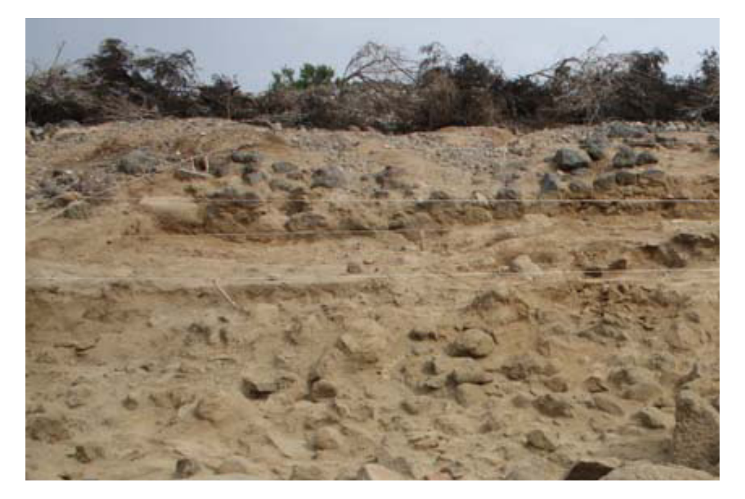
Fig. 2: Sector 1, view from south of a collapsed wall from the latest occupation phase.