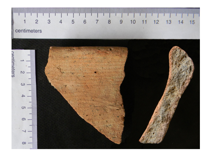
Fig. 12: Large orange-red micaceous ware rim sherd of a jar with scraped external surface.