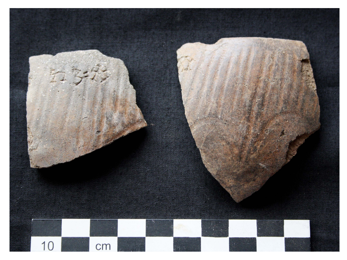
Fig. 10: Rim sherd of brown mineral tempered ware red slipped closed cup with vertical grooves and a cross and a Ge'ez inscription under the rim.