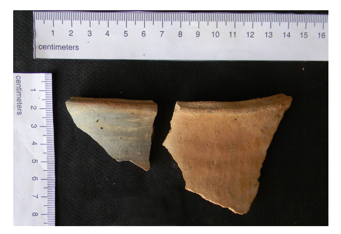
Fig. 8: Fragments of orange-red micaceous ware bag-shaped Adulitan jars.