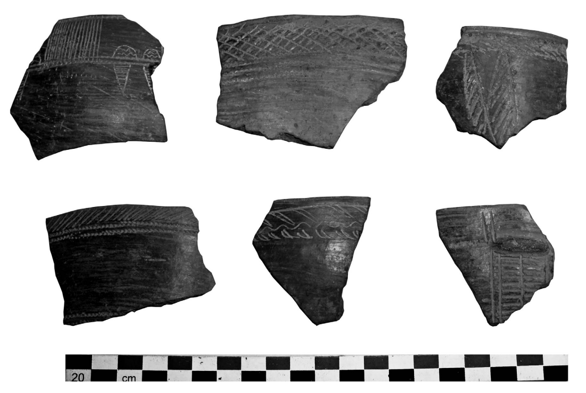
Fig. 4: Decoration of incised and impressed patterns on the external surface of some black-grey ware sherds of Adulitan bowls (Paribeni collection, National Museum of Asmara).