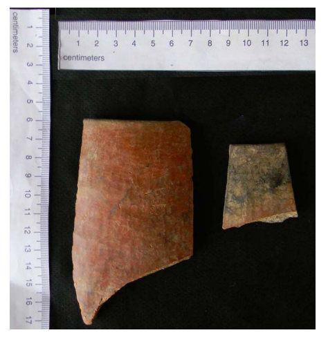
Fig. 11: Black-topped beakers.