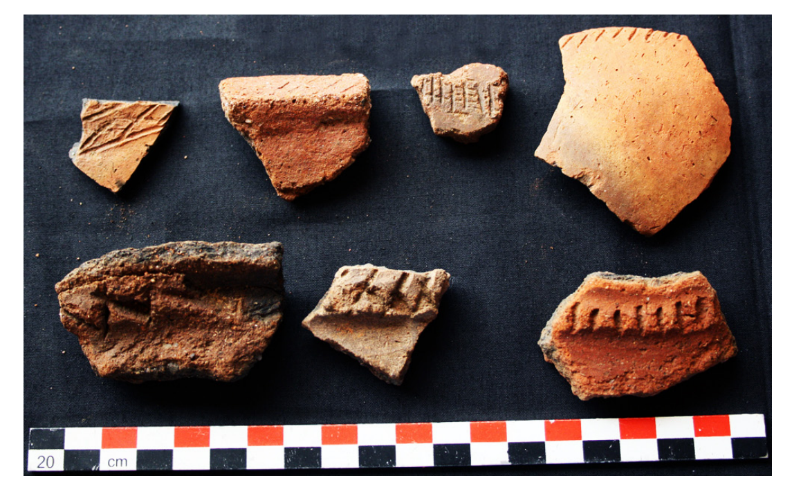
Fig. 9: Fragments of red-brown micaceous and organic tempered ware Adulitan bowls with incised rim, jars or bottles with incised moulded ledges on the shoulders.

http://www.britishmuseum.org/research/online_journals/bmsaes/issue_18/zazzaro_manzo.aspx