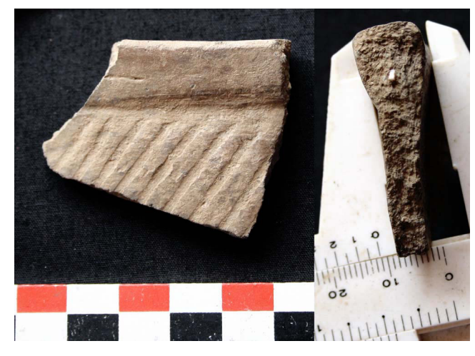
Fig. 5: Rim sherds of Adulitan black-grey micaceous ware bowl with flat triangular in section rim, decorated with oblique incisions on the external surface.