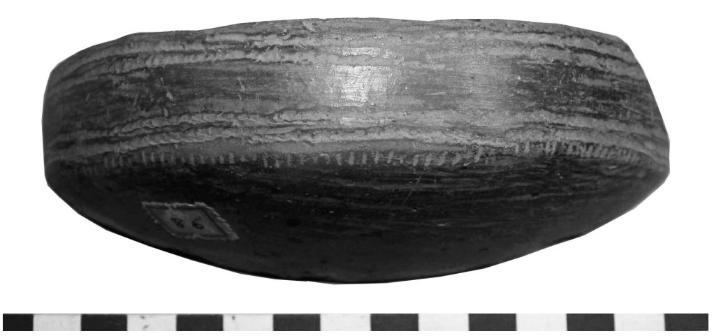
Fig. 3: Fragment of a black-grey polished mineral and micaceous Adulitan carinated bowl with decoration along the rim and the carina possibly obtained by impressing the edge of a shell on the wet paste (Paribeni collection, National Museum of Asmara).